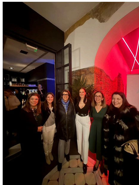
The cutting of the vasilopita is a cherished tradition, and there is more than one way to celebrate it. The event of 28th of January marked the start of the new year and offered an